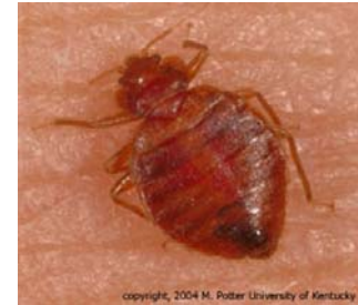
Adult bed bug

Bites or rashes can be caused by a number of things and are not reliable signs of a bed bug problem. Look for actual bed bugs and their fecal smears. Bed bugs are reddish-brown, oval, flattened insects from 1/4” - 1/3” long and 1/16” - 1/8” wide before feeding (picture above). After a blood-meal, they are swollen and dull red.