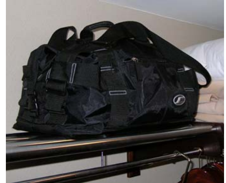
Be careful where you keep luggage during any travel.